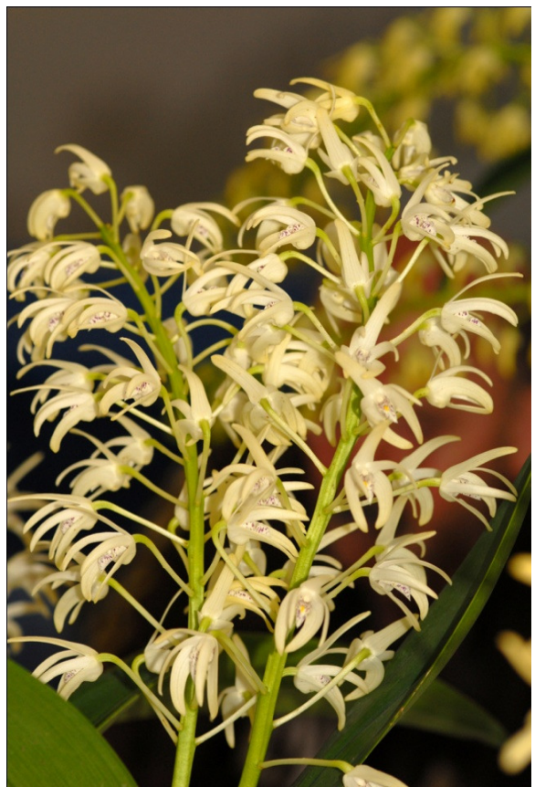
Dendrobium speciosum – King Orchid

Sheila Deakin brought in three magnificent Dendrobium speciosum varieties in pots. D. speciosum are found on the east coast from north Queensland to Eastern Victoria