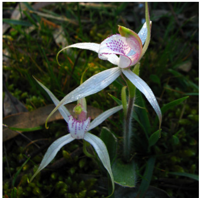
Arachnorchis pumila

Arachnorchis pumila , the Dwarf Spider Orchid was discovered in 1922 and last seen in 1926. It was listed as extinct. Then in September 2009, a retired couple found an orchid at Inverleigh that they could not identify. It was eventually given a positive I.D. by DSE officials, and steps were taken to ensure that it survives. The area has been protected, the plant was hand-pollinated and seeds collected to establish a 'captive' breeding program. It is a beautifully delicate little orchid, which, hopefully, will be a regular sight on the Inverleigh Flora and Fauna Reserve in future.