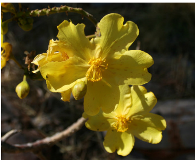
Kapok Bush - Cochlospermum fraseri

Further stops were at Bell Gorge, Windjana Gorge to admire the freshwater crocodiles and at Fitzroy Crossing for a cruise through Geikie Gorge, then on to Broome.