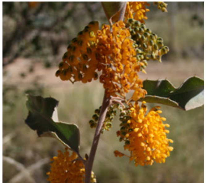
Blue Grevillea – Grevillea agrifolia