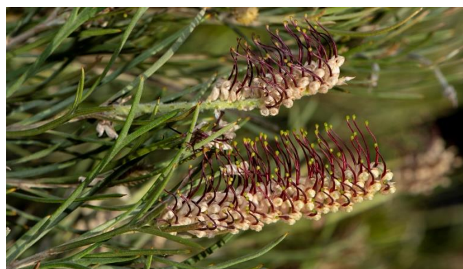
G. hookeriana – Black-flowered form

There are always grevilleas on the table and tonight was no exception. Cultivars are very common in grevilleas and we had 'Molly', 'Moonlight', 'Ivory Whip', 'Billy Bonkers', 'Sylvia', 'Peaches'n'Cream' and many others. Among the true species were G. sericea , a large open shrub with pale lilac/pink flowers, G. hookeriana which has deep maroon, tooth-brush flowers and G. bipinnatifida which is one of the parents of many of the 'Queensland hybrids'.