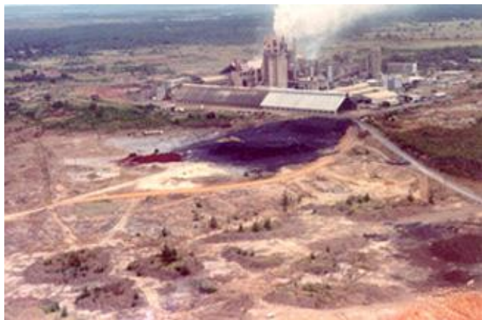
The Bamburi Quarry