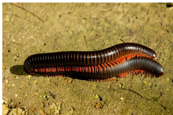
Red-legged millipede, Ephibolus pulchripes

The casuarina has adapted to grow under severe conditions, tolerating brackish water, which seemed perfect for the environment. However, due to the tree's high tannin content, its needles don't break down readily. Haller observed a red-legged millipede, Ephibolus pulchripes , feeding on dry casuarina needles, and sent locals out to find as many as they could. He introduced hundreds of millipedes into the old quarry. Their droppings made it easier for bacteria to break down the Casuarina needles, resulting in a rich layer of humus for other plant species to grow in.