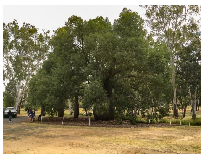
The 'Big Bottle Tree' in Roma, Queensland

Our speaker at the March meeting spoke about Werribee Zoo's use of these trees to create a pseudo-African theme, because of their superficial resemblance to the African Baobab. As I write, we are in our caravan at Roma, in central Queensland, home of 'The Biggest Bottle Tree'. So it seemed that the stars were aligned and an article was warranted.