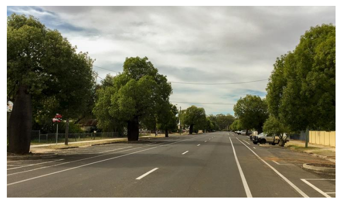
Street trees in Roma

Tree' stand in a small park, fenced to protect it from initial carving yobbos. Although it is only six metres high, the canopy spreads over 20 metres and the girth of the trunk measures 9.5 metres. It was transplanted as a mature tree in 1927 so is now well over 100 years old.