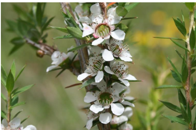
L.scoparium in Victoria

L. scoparium is native to south-eastern Australia and to New Zealand. In Australia its common name is Broom Tea-tree and it is found coastally from around Sydney to the Yarra Ranges, and in Tasmania. The flowers are white, rarely very pale pink. It's a hardy plant in the garden, but that's about all. In New Zealand, it is known as Manuka, and is the source of the incredibly expensive, but very tasty, Manuka honey.