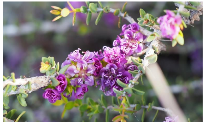
Melaleuca violacea - Image: Geoff Derrin

Melaleucas were well represented this month. M. lutea is a plant from around the Fitzgerald River National Park in southern W.A. It was renamed from M. citrina , to allow Callistamon citrinus to be moved into Melaleuca. The flowers are bright yellow and presented on an oval shaped spike. M. spathulata is a compact shrub from the far south west of W.A. it has small bright pink/purple flowers in spring. M. filifolia is a small shrub found in W.A. from Kalbarri south to around Geraldton. It has long, wiry foliage and lovely, spherical pink flowers. M. violacea is a straggly shrub from the south west corner of W.A. It has deep purple, and, to me, most un-Melaleuca-like flowers.