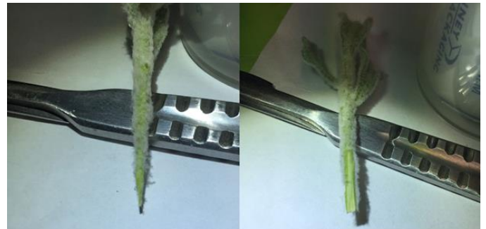
The prepared scion from two angles

Cut the bottom of the Scion to a wedge to expose the vascular system on each side. It must be a wedge, not a point. If you cut to a point you will have removed all the vascular system.