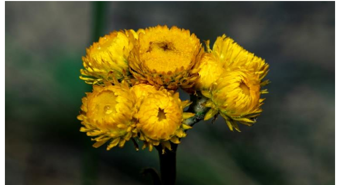
Chrysocephalum semiapposum – Clustered Everlasting

Most of the flowers were white – Argentipallium and Burchardia - or yellow – Chrysocephalum , Coronidium and Goodenia - with the occasional flash of blue from Brunonia and Dianella .