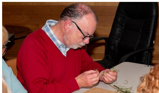
Insert Tab A into Slot B

A ventilated hood over the plants keeps the humidity high, without condensation which will wet the scion and lead to failed grafts. When the Eremophila is ready for re-potting, you should see healthy new growth above the graft and probably some extra growth from the rootstock. You may also see roots from the bottom of the pot. Remove any growth from the rootstock, but leave the original leaves from your cutting. These leaves continue to supply energy to the scion and should not be removed until the top growth is the size of a tennis ball. Watch out for shoots off the side of the slit used to form your graft, these must be removed flush with the stem.