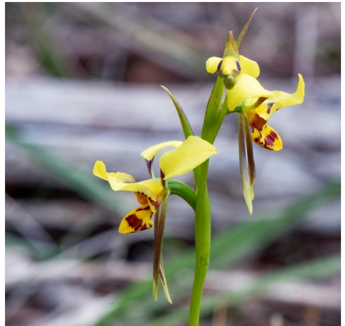
Diuris sulphurea – Tiger Orchid

Despite it being late in the season, there were a few orchids. The Notched Onion-orchid, Microtis arenaria was fairly common. There were a couple of donkey orchids, Diuris orientis and D. sulphurea and a few straggling blue Sun-orchids reluctant to open in the cold and overcast conditions.