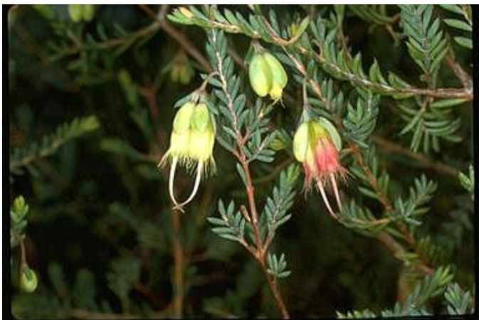
Homoranthus darwinioides

Homoranthus darwinioides is a small shrub with pendulous yellow and pink flowers. It is found in central east NSW from around Dubbo to Denman. The flowers are said to have an unusual mousy smell.