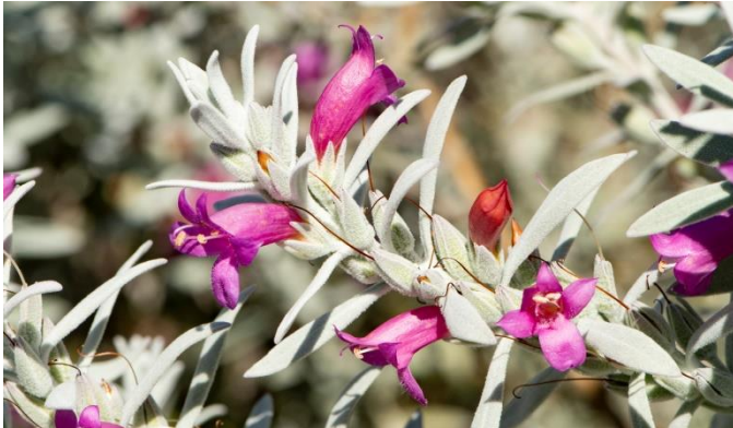
Eremophila 'Pink Panther', a grafted hybrid