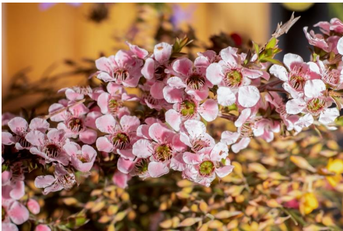
One of the pale, possibly hybrid Leptospermum

I think by far the most striking plant on the table was a very deep crimson specimen of Leptospermum scoparium . (See 'Plant of the Month' article below.) There were two other specimens, both seedlings from Matt's garden that may be hybrids with L. horizontalis which is thought to be a semi-prostrate form of the local tea-tree, L. continentale . Both were pale pink.