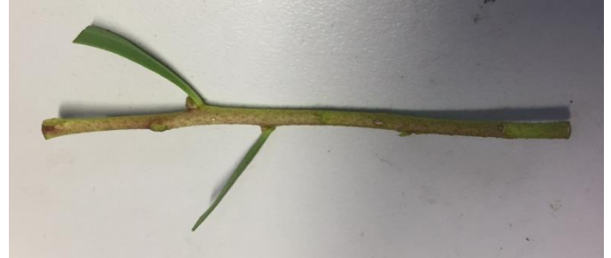
Myoporum rootstock prepared for grafting

The scions ( the Eremophila material to be grafted) need to have 3 or 4 nodes, and the leaves should be cut in half to help reduce moisture needs.