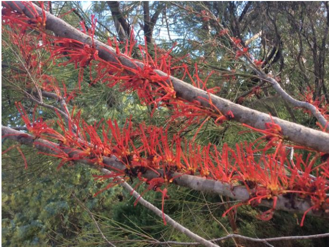
Hakea orthorrhyncha , Bird Beak Hakea