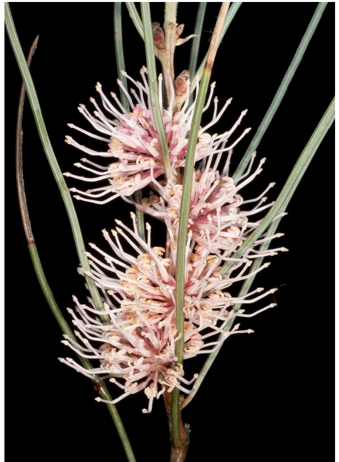
Hakea invaginata

Hakea subsulcata is an upright shrub with needle leaves and pink/purple flowers. Hakea cristata is an attractive shrub with hard, holly-like leaves and white flowers.