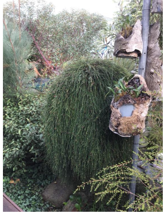
Sheila's 'Cousin It' – Casuarina glauca

Sheila followed with a story of hardship and deprivation, which she finally overcame by buying the plant she wanted for the garden, a standardised Casuarina glauca , 'Cousin It'. It is a strange, non-flowering plant originating at Bulli south of Sydney. The stems grow horizontally and mould over surfaces such as rocks and logs, or trailing down walls. The reason for its form and failure to produce flowers is not known.