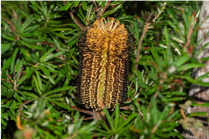
Banksia spinulosa – ‘Black Magic’