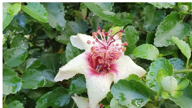
Hibiscus insularis – the Phillip Island Hibiscus

Phillip Island Hibiscus. And no, it's not the Philip Island in Victoria, but rather the Philip Island found just south of Norfolk Island. The entire natural population of this plant is just two clumps which are 'clones'. It has been propagated and planted more widely on Phillip Island, but only vegetatively which does not increase the genetic diversity. Apparently no seedlings of this plant have ever been found.