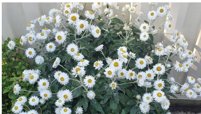
Coronidium elatum -Tall Everlasting

A stunning daisy plant Coronidium elatum - Tall Everlasting, made quite an impression on members present, as did a magnificent Grevillea hybrid, calliantha x asparagoides .