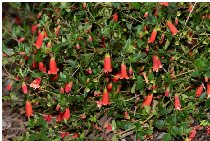
Correa pulchella 'Gypsy'

Following my presentation at the last meeting, I thought an article on one of the most striking Correas – C. pulchella – was in order.