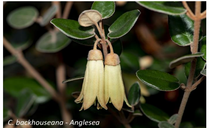
C. backhouseana - Anglesea