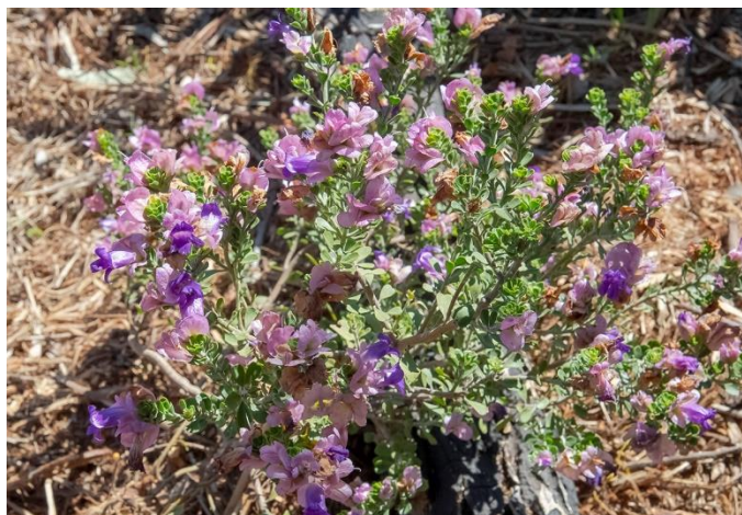
Frank's E. cuneifolia

It does not grow well in Victoria unless grafted, usually onto Myoporum sp. Stock. It responds well to pruning which helps to keep a compact shape. The flower consists of a deep pink to purple corolla or tube, surrounded by colourful lighter pink sepals; after the flower falls, the sepals remain on the plant for a long time, continuing a colourful display. It is quite hardy, and tolerates dry conditions, but is very frost sensitive, so some thought needs to be given to its location in the garden, or it can be grown in pots where it will forgive neglectful gardeners who fail to water frequently.