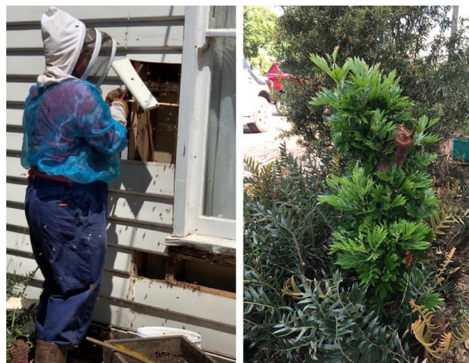
'Bee Man' wreaks havoc - 'White Candelabra' reshoots

Oh, and the painting went well, although I developed a nasty rash from touching the paintbrush. 😊