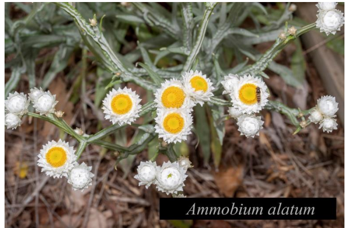
Ammobium alatum

There were a number of Asteraceae on display. Xerochrysum bracteatum is available in a multitude of colours. It's large and showy paper-daisy flowers make it a popular garden plant. Those on show were a vibrant gold, and a deep red with yellow centre. Trachymene coerulea , the Rottneest Island daisy is an erect perennial with bright blue, pin-cushion flowers. Ammobium elatum is another perennial plant, with silvery foliage and small but abundant papery white flowers with large golden, contrasting centres. It self-seeds very readily. (Frank Scheelings gave me a couple of these innocent-looking plants. They grew extremely quickly and produced flowers on metre-long stalks which tried to bite me every time I walked past. Plant at your peril!)