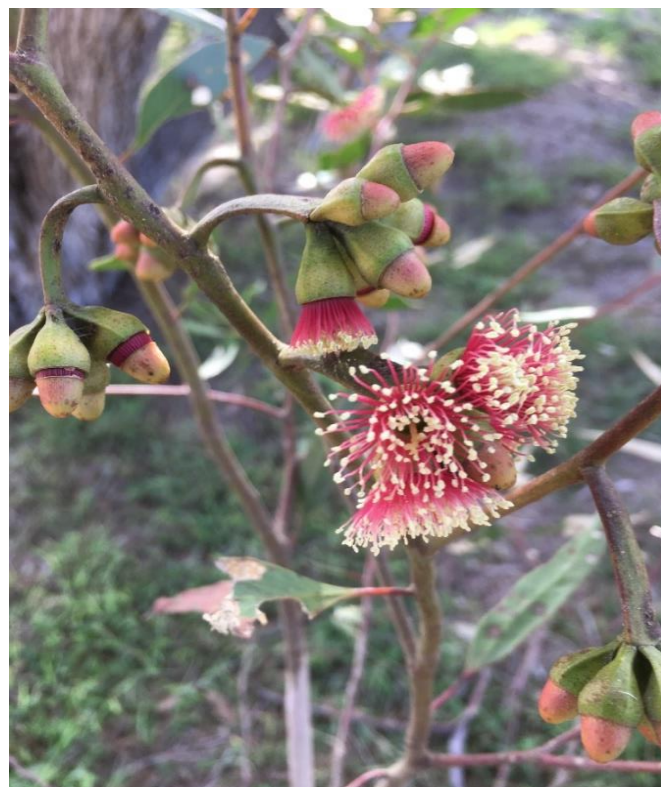
The 'mystery' plant in flower

So it was a pleasant surprise to note sprouting from the "dead stump". I have no idea how long the stump had been dormant. I was pretty thrilled when the sole surviving branch from that sprouting bore masses of beautiful flowers several years later.