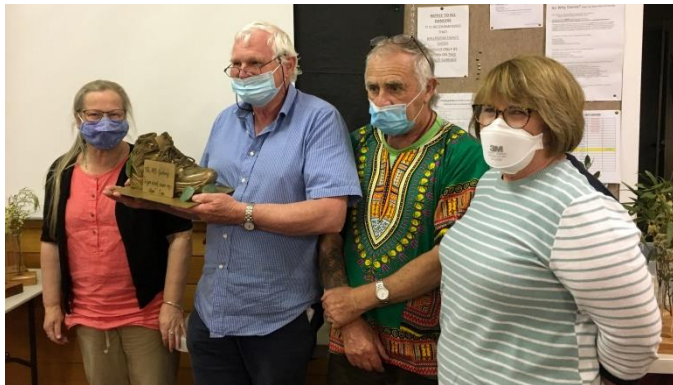
Our overall winners, 'The Rooting Hormones'

'The Pistils' won the Anatomy challenge, and 'The Rooting Hormones' took out the plant table challenge, Plant Bingo , and the overall Championship.