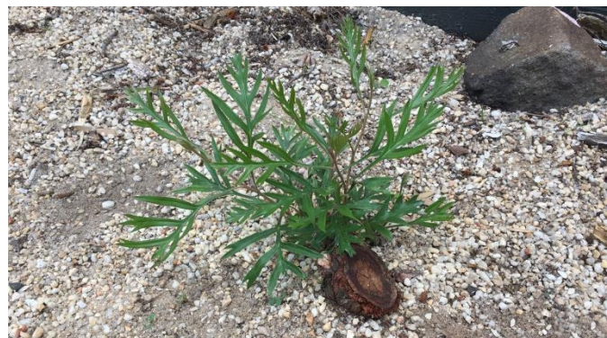
Grevillea 'Superb' ... from a ground-level stump

I've often been heard to wonder at the fickle nature of Grevilleas; their ability to be flowering profusely one day and be dead and dry two days later. But, not this time. Both my Grevilleas refuse to die, and though nothing was left but a stump, both have re-sprouted. To say I'm happy would indeed be an understatement.