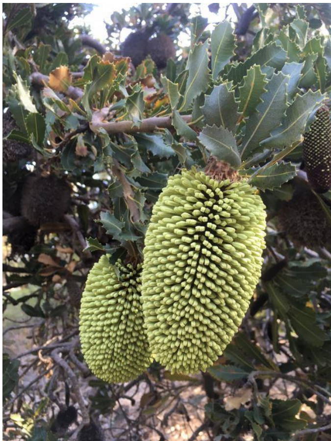
Banksia lehmanniana

Banksias are always a feature of our table with many members having an affinity for growing them. Among tonight's offerings was Banksia burdettii , a shrub with lovely orange and white flowers, similar to B. prionotes . Banksia praemorsa , the Cut-leaf Banksia is a beautiful ornamental shrub that usually features deep red flowers. Our specimen was of the yellow-flowered form. Banksia aculeata is a tall shrub with dense, prickly-edged leaves and pendulous, red/brown flowers, reminiscent of pine cones when in bud.