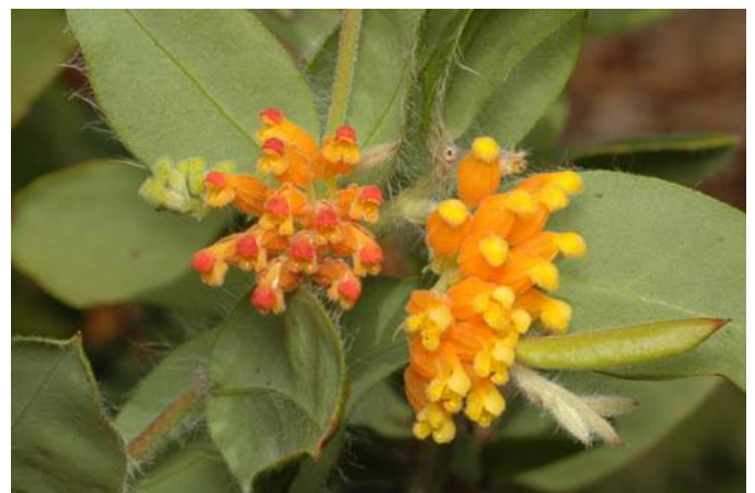
G. pimeliodes - Photo: By Murray Fagg, Wikipedia

It is a very attractive plant with a relatively long flowering season, but may be difficult to maintain in our humid summers. It prefers open sunny or part shade and needs water in the hotter months. Its natural habitat of Jarrah and Marri forestes in south west WA mean it is suitable to grow under more mature Eucalypts.