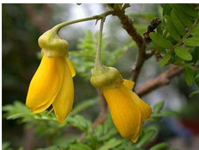
Sophora toromira - an Easter Island plant extinct in the wild since 1960. Five specimens are held at GBG

Kellee sees the role of horticulture in conservation as an integral part of the work of GBG. To recognise the importance of local flora; to be representative of genetic diversity of target populations in the wild as an insurance policy – local, native and international plants; and to support conservation education and environmental awareness in conjunction with groups like APS Geelong. How do we harness to knowledge held by gardeners and plant enthusiasts?