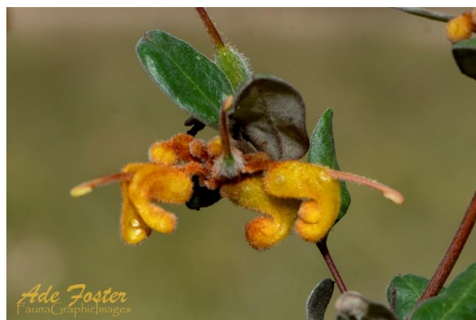
Grevillea chrysophaea – Brisbane Ranges

Indigenous plants are important here, too. By actively displaying the regions flora and capturing its diversity people can see the potential for them as garden plants. Plants of the Brisbane Ranges National Park are a prime example. There are a number of rare and endangered plants there ( Grevillea chrysophaea , Grevillea steigitziana ) – and many not so rare plants that would make a great addition to a garden.