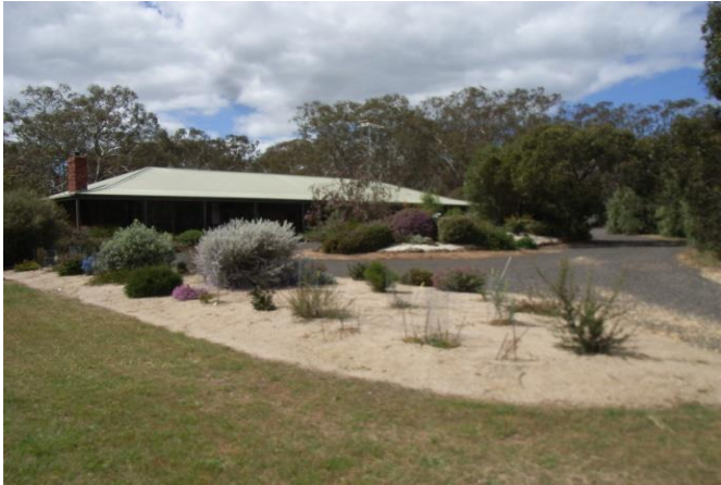
Leach garden at 42 Gregory Drive, Inverleigh

On Saturday, September 2 nd we have been invited to join with members from The Friends of Melton Botanic Gardens to visit the Leach's garden in Inverleigh, and the garden of their neighbours, the Kerdels. We'll meet Matt at 42 Gregory Drive, Inverleigh at 1:30 pm.