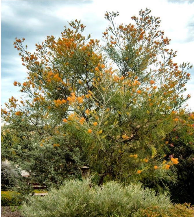
Grevillea 'Midas Touch' in full flower

Such hybrids included 'Evelyn's Coronet', 'Red Hooks', 'Scarlet King' and Winpara Gold ... all great plants for the garden. Grevillea 'Midas Touch' is a seedling from G. juncifolia growing in Ade's garden in Belmont. It was labelled as 'a tall shrub to 3m' when purchased some ten years ago. It is now a tree at 5m x 5m and is truly spectacular in the spring.