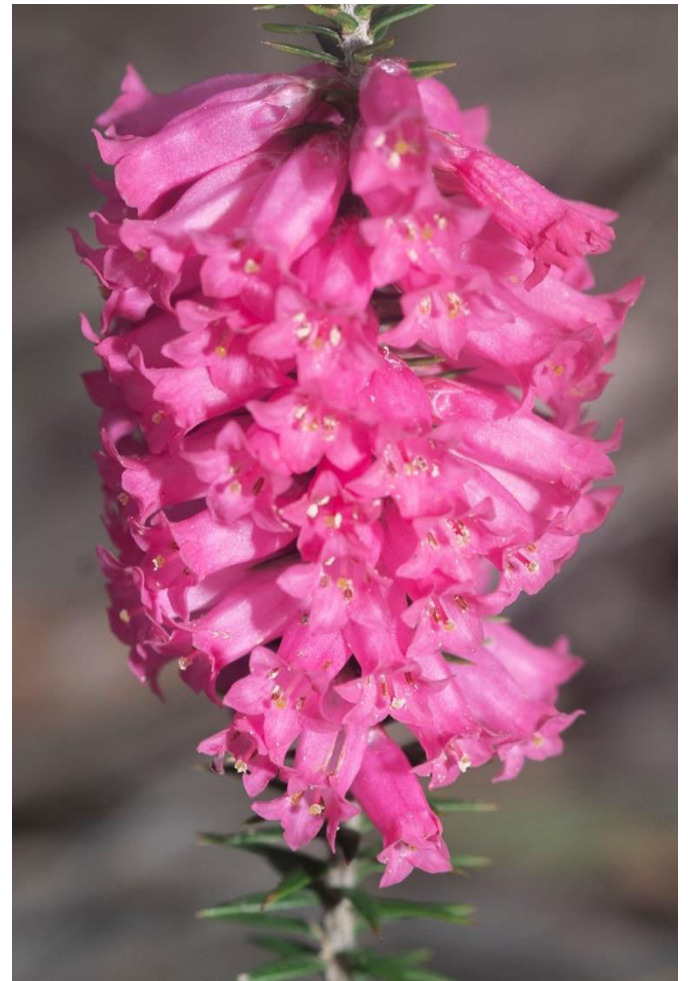
Epacris impressa - Anglesea

First of all, can anyone actually name Victoria's floral emblem? For those of you who can't recall, it's the pink common heath. Native to south-east Australia, it's a small shrub with clusters of tube-like flowers that attract honey-eating birds.