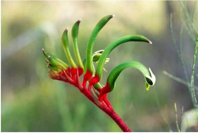
Anigozanthos manglesii – WA floral emblem

There is no obvious bold and beautiful plant that sums up Victoria now and its history over tens of thousands of years. A starting point might be a Victorian endemic, a species that grows only within our state border, but we have few of those. The common heath itself is equally common in Tasmania.