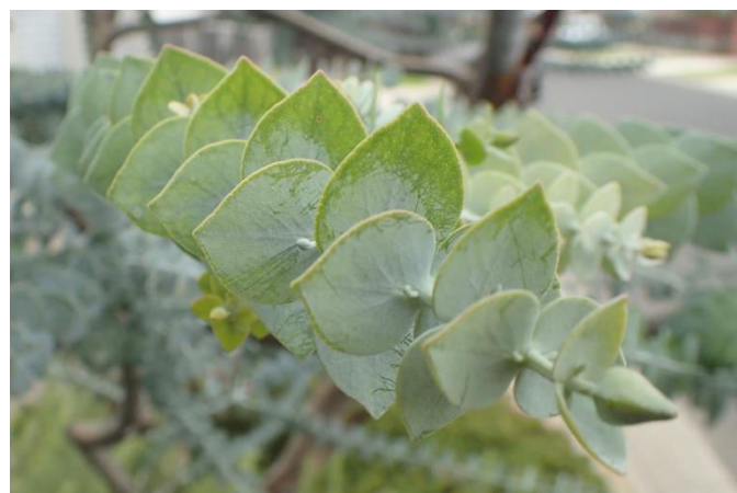
The leaves of E. pulverulenta

In Ivan Holiday's book, 'A Gardener's Guide to Eucalyptus,' it is described as a small narrow, sometimes straggly tree to about 7metres high. I think this under sells its virtues. It is restricted to only a few locations of the central and southern tablelands of New South Wales, including the Blue Mountains.