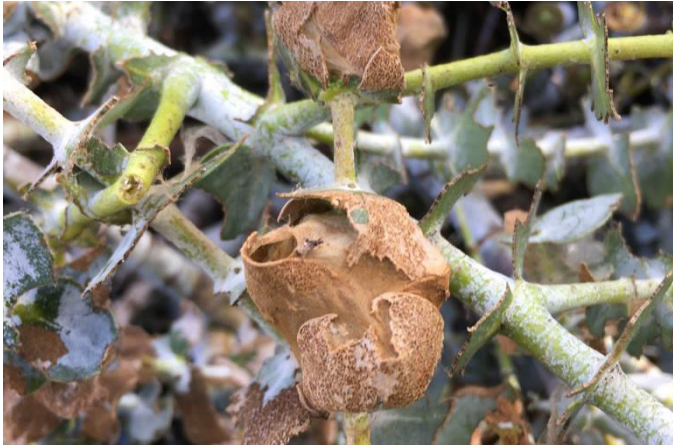
Caterpillar damage – May 2021

My solution was in May 2021 to cut the tree back and remove all the foliage. I have managed to keep the tree clear of caterpillars and remove any that try to sneak in for a feed. If any of our members can enlighten me, I would be interested to know what type of moth is responsible for the damage.