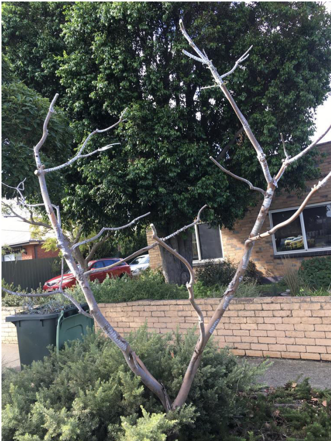
After the cutback – April 2021

My solution was in May 2021 to cut the tree back and remove all the foliage. I have managed to keep the tree clear of caterpillars and remove any that try to sneak in for a feed. If any of our members can enlighten me, I would be interested to know what type of moth is responsible for the damage.