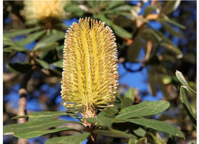
Banksia marginata , Angelsea

For a plant with a more flamboyant and well-known flower we could look to our heathlands, to species of grevillea, correa or even a native ground orchid such as caladenia. But none would be immediately recognisable or compete, I think, with the waratah or kangaroo paw. My current favourite is a banksia of some kind. I'd suggest the silver banksia, Banksia marginata , a tough, nuggety plant with pale yellow flowers in a bold flower head. Not a show-off flower like the Telopea but something with a deeper, lasting beauty.