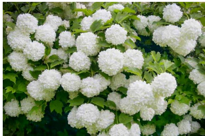
Viburnum opulus – Kalyna.

And, in keeping with the theme of our weekend, we discovered that the Lodge was named for a plant, Viburnum opulus or Kalyna, in the Ukrainian language.