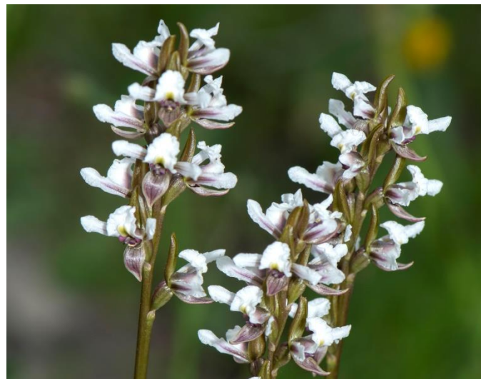
Prasophyllum suttoni – Mauve Leek-orchid

And, in keeping with the theme of our weekend, we discovered that the Lodge was named for a plant, Viburnum opulus or Kalyna, in the Ukrainian language.