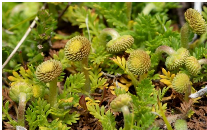
Cotula alpina – Alpine Cotula

Cotula alpina – Alpine Cotula is a small, prostrate plant of the damper areas of mainland high country. It is common in Tasmania.