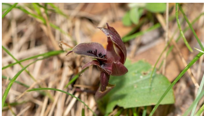
Chiloglottis valida – Common Bird Orchid

Orchids were a feature of the landscape, with the Mauve Leek-orchid - Prasophyllum suttoni , very common indeed. We also saw Prasophyllum tadgellianum – Alpine Leek-orchid, Pterostylis crassicaulis - Alpine Swan Greenhood and Chiloglottis valida – the Common Bird-orchid.