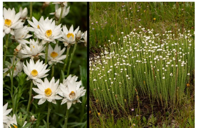
Rhodanthe anthemoides – Camomile Sunray

But among all the daisies there were other gems to be found. Veronica nivea – The Milfoil or Snow Speedwell is one such. A stunning small plant to about 50cm with spikes of glorious mauve/blue and white flowers.