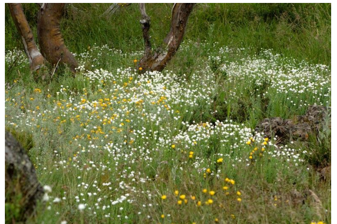
Rhodanthe, Chrysocephalum and Craspedia on Little Mt. Higginbotham