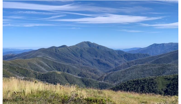
The High Country

We kicked off the year with a weekend at Mt. Hotham, and what a truly wonderful weekend it was. We stayed at Kalyna Ski Club Lodge, built by a co-operative of Ukrainian migrants in the 1970s, and recently renovated. The facilities were amazing ... comfortable, spacious and everything you could think of was provided. And the views? ... Spectacular!