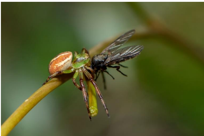
A Crab Spider – Thomisidae , with a fly for lunch

In typical fashion, it was not just the plants that caught my attention. There were a host of insects and spiders to be photographed and identified.