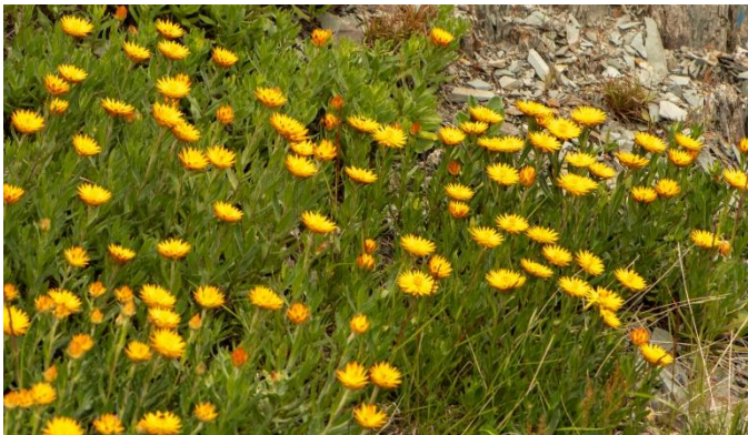
Bracteantha subundulata – The Cross, Mt. Hotham

The number and variety of plants was a real treat, and while the cooler, wet spring and summer had altered the flowering time somewhat, there was plenty to see and talk about.