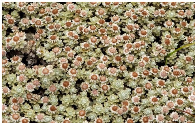
Ewartia nubigena – Mt. Hotham Summit

Many of the plants we found were quite small and unassuming, but no less beautiful for that. Ewartia nubigena – The Silver Ewartia or Native Eidelweiss, is a small prostrate plant that forms quite dense mats in bare patches on the higher altitudes.