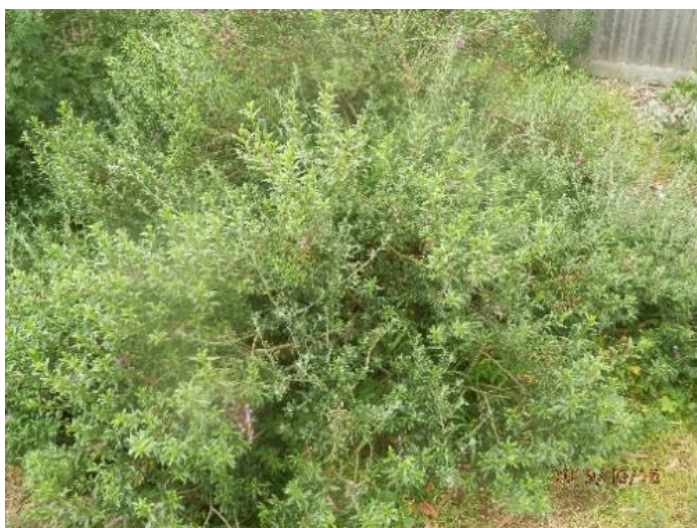
The bush in my garden