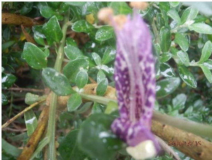
The spotted inside of the flower