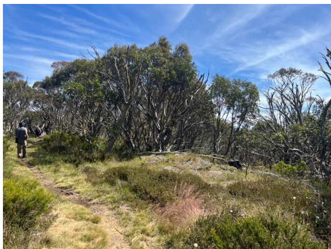
Dead Timber Hill Track