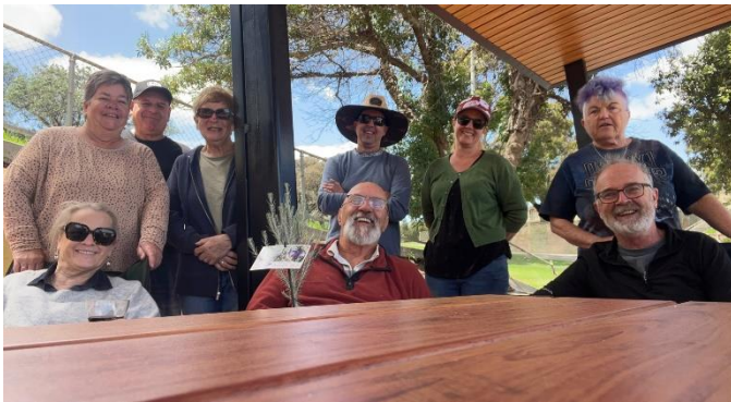
Hardy Members attend Christmas Party

Our Christmas BBQ break-up was held in St.Helen's Park on 8 th December. It turned out to be a bit of a blustery day with just nine hardy members in attendance. The new shelter was put to good use and the protection from the wind greatly appreciated. The BBQs are a little distant from the shelter, but we're all young and fit and managed the trek without too much incident.