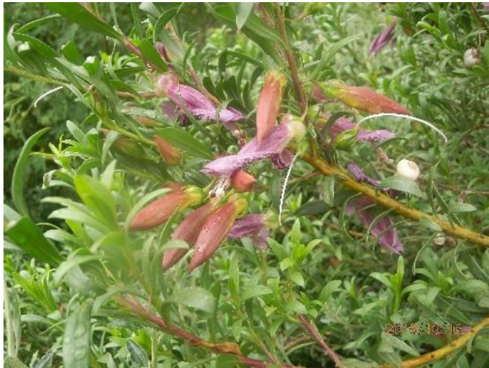
The flowers of Eremophila Maculata

readily. I will put that to the test in the near future. All-in-all, a wonderful bush as a filler in a sunny position.