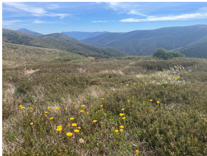
View from Razorback Track

Story by Bruce McGinness. Photo credits mostly to Nicole Leach